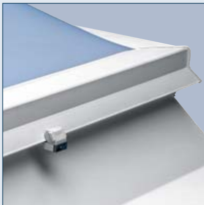
ESSMANN skylight dome with kerb frame and skylight base made of U-PVC, prepared for daily ventilation.

The kerb frame also protects the edges of the acrylic skins and allows for quick installation of the skylight dome with the help of the functionally reliable hinges.